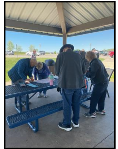
Model A members assembling their kites!