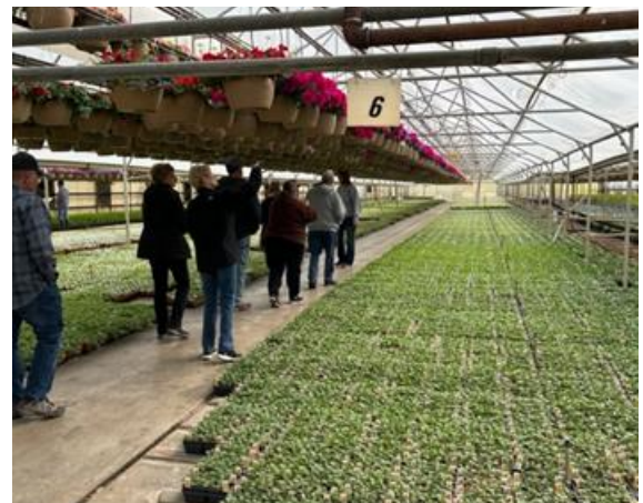
Over 7 acres of plants under roof!

Upon completing our tour of Sedan Floral, we drove the Model A's to the Emmet Kelly Museum. Located in downtown Sedan at the old Opera House, the museum has become a repository of news clippings, photos and artifacts relating to Sedan's famous son, Emmet Kelly, aka Weary Willie.