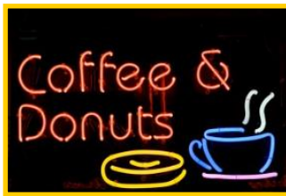
Coffee and donuts at Tom Ruggles garage on April 4th!