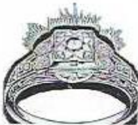
Diamond and White Gold