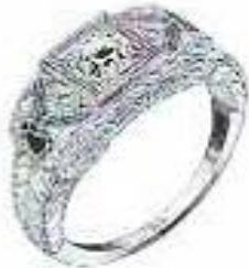
Diamonds and Sapphires