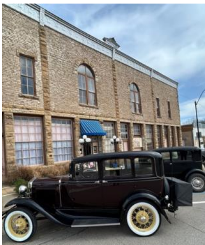
Model A's at the Emmet Kelly Museum

Upon completing our tour of Sedan Floral, we drove the Model A's to the Emmet Kelly Museum. Located in downtown Sedan at the old Opera House, the museum has become a repository of news clippings, photos and artifacts relating to Sedan's famous son, Emmet Kelly, aka Weary Willie.