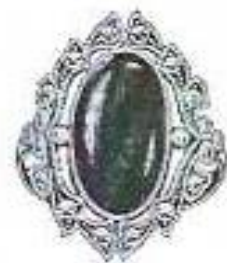
Sardonyx and Marcasite