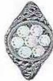
Diamond Cluster Ring