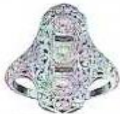
Diamond and Sapphire Cocktail Ring