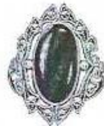
Sardonyx and Marcasite