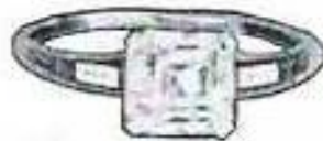
Marquise and Emerald Cut Diamonds