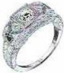
Diamonds and Sapphires