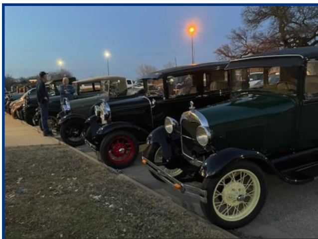
A Beautiful evening for the Model A Meeting in February!