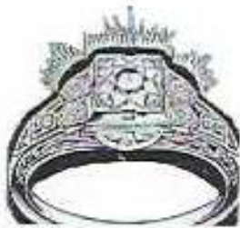
Diamond and White Gold