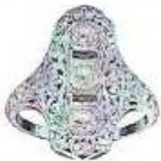
Diamond and Sapphire Cocktail Ring