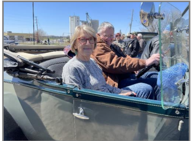
Some of our members gave the townspeople rides in their Model A's and some were brave enough to let them drive their A's!!