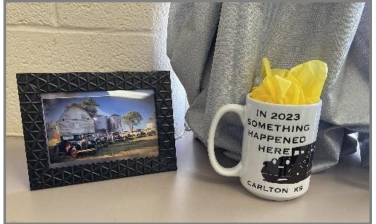
The town of Carlton gave each Wichita A member a coffee mug and a picture of a previous visit with our Model A's.