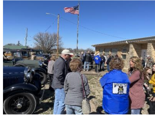
Placing the new signs!