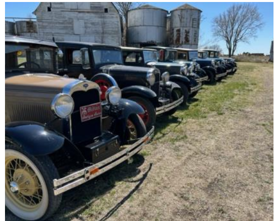
All of the Model A members who attended are shown with all the signs they have placed in Carlton over the years.